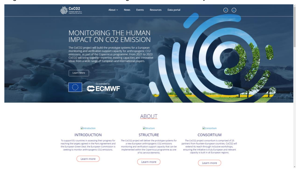
Figure 1: CoCO2 Project Website

The CoCO2 website (<u>www.coco2-project.eu</u>) serves as the main dissemination instrument for the project. It contains various sections both for the general public as well as specifically targeted towards stakeholders including the scientific community.